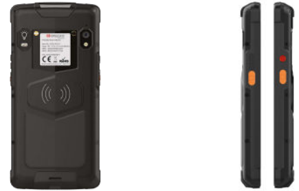
SD55L Lynx II Mobile Computer

Take your business to the next level with this rugged Android mobile computer.