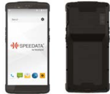
front and backside of the SD55UHF