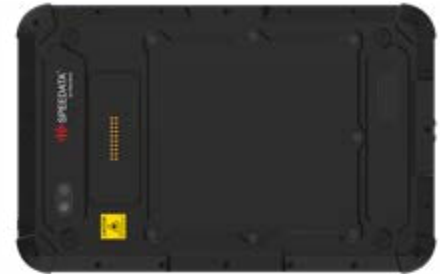
backside of the SD80