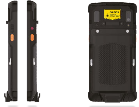
SD60 Pegasus II Mobile Computer

Empower your workforce with this perfect mobile computer, armed for business.